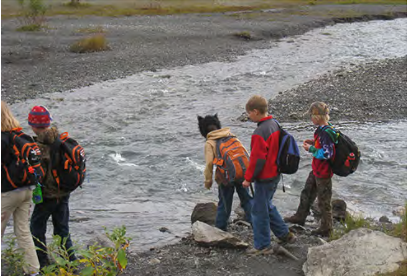
Figure 4. Students explore the environment during a nature walk.

of departure for an exploration of scientific concepts or a study of maps. The opportunities for small integrations on a regular basis are endless, but they are contingent on both teachers' willingness to look for such opportunities and on teachers' knowledge of relevant community-based resources.