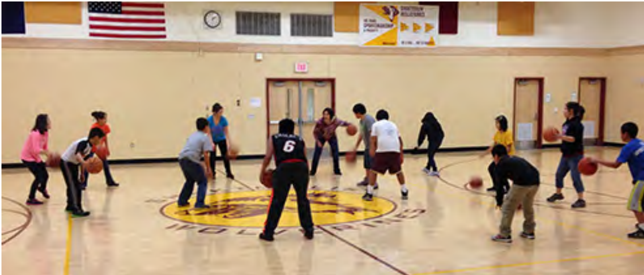
Figure 6. An intern plays basketball with her students.

Experiences with the community and nontraditional sources of information. Other opportunities and requirements for interacting with the community or locating and using nontraditional sources of information are infused throughout the year-long internship. Over the course of the year, our interns are required to maintain a “log of collaboration” that chronicles their collaborative efforts within and beyond their internship schools. As part of this assignment, they are twice required to attend or participate in events that support the cultural and linguistic heritage of the community in which their school is located. At the start of the school year, we brainstorm a list of opportunities to meet this requirement; the primary criteria are that the activities must not be school related and that they cannot take place on school grounds. Interns attend a wide variety of activities to fulfill this requirement, from the yearly Native Arts Festival to sporting events to which their students have invited them.