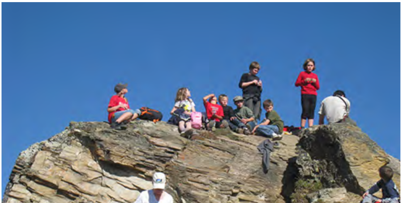
Figure 2. Students on a field trip explore a local geographic landmark.

An understanding of community context, however, should not stop at the level of human-based histories, challenges, resources, and spaces. These elements do not exist outside of the natural environment or place in which the community is located. Gruenewald (2008) writes that “Place foregrounds a narrative of local and regional politics that is attuned to the particularities of where people actually live” (p. 308). Scollon and Scollon (1988), in describing a potential place-based curriculum, list 32 questions on a proposed final exam testing “How Well Do You Know Your