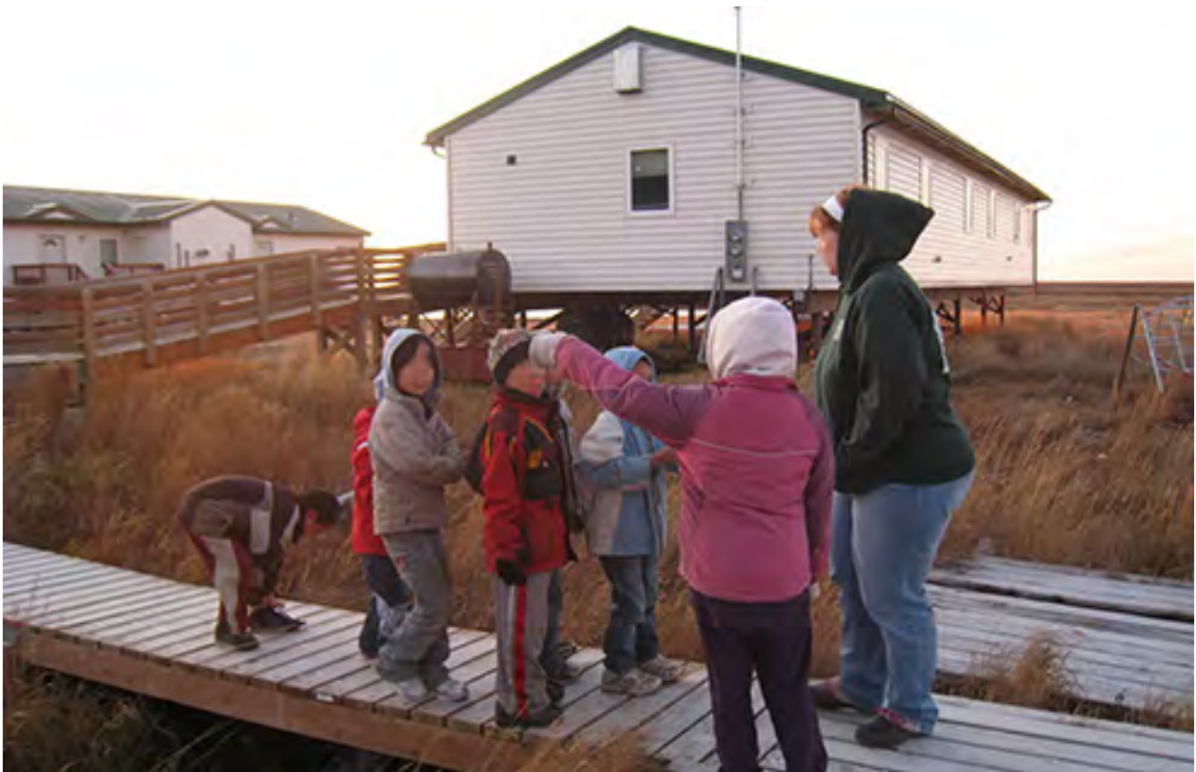
Figure 3. An intern teacher in Western Alaska takes her students on a walk through the community.