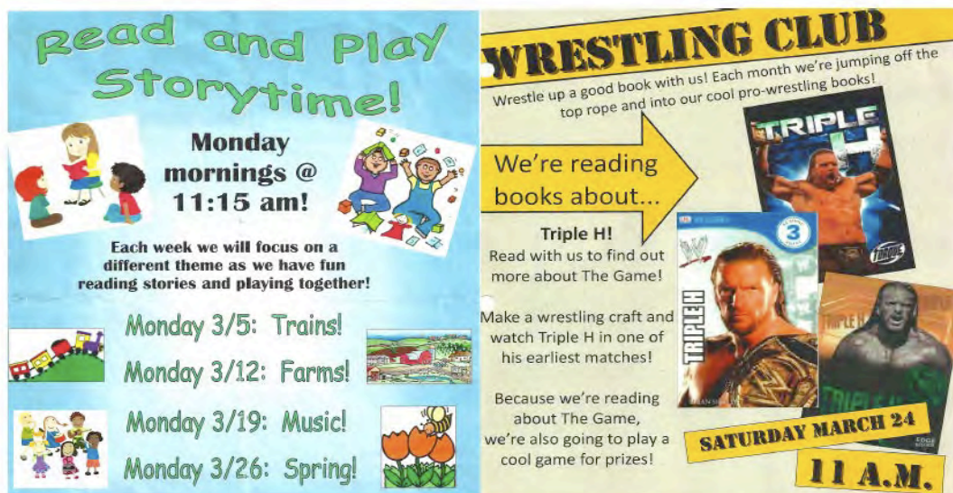
Figure 1: Promotional flyers for regular preschool story time (left) and Wrestling Club (right)

Most of the library’s story times—during which librarians typically read several picture books, prepared a simple craft for the children to complete, and often performed a puppet show—were