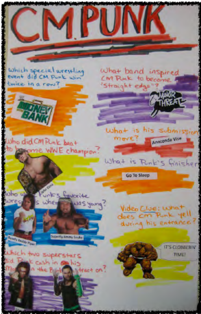
Figure 3: Answer board from the CM Punk Wrestling Club event at Fleetwood