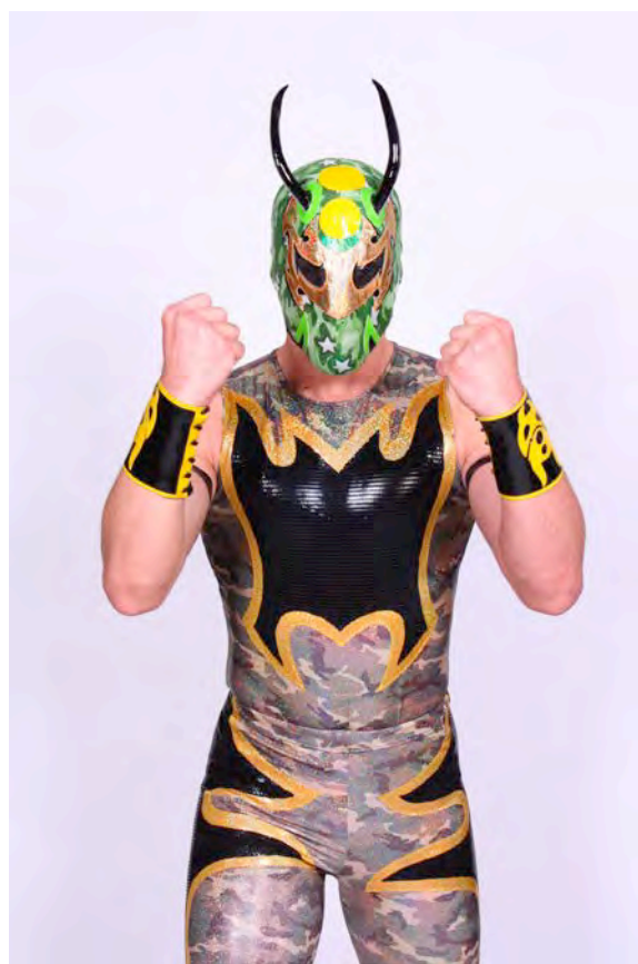
Figure 2: Soldier Ant (used with permission from CHIKARA).

The easy version lasted about half an hour.