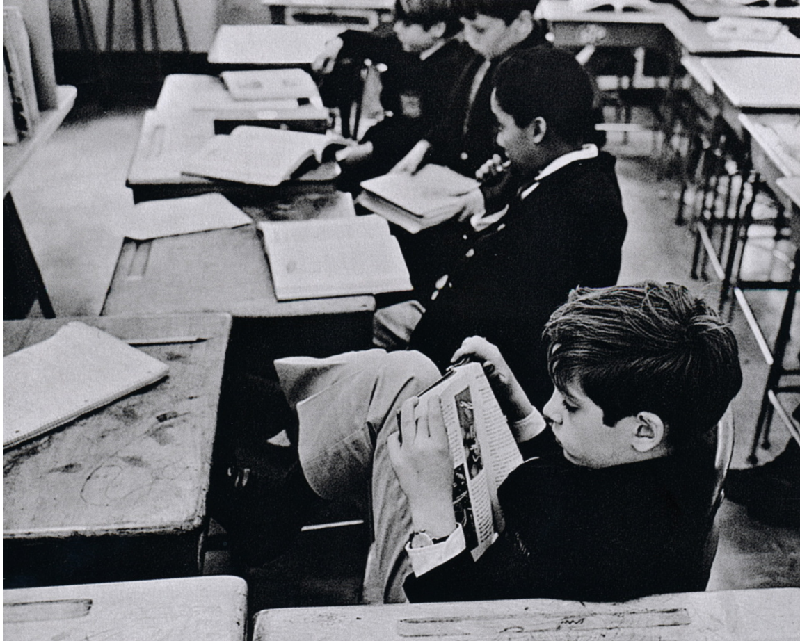
“New York City, April 23, 1969.”