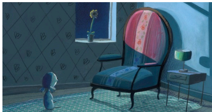
The Heart and the Bottle , pp. 13-14, Oliver Jeffers© 2010

Kaleb and I had just reached the double-page spread in Jeffers' text where the main character, a nameless little girl, faces an empty chair in a darkening room. His attention remained seemingly focused on his own body movements and exploration of my cheek.