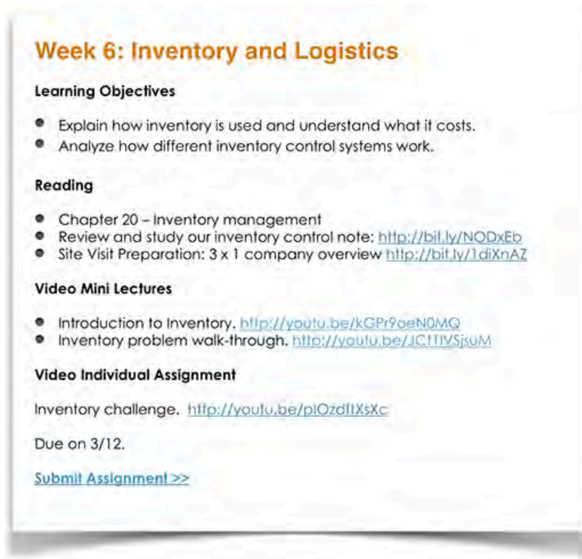
Figure 4. A weekly online lesson for Ops in NYC.

online; to work in teams on real business challenges; and to observe those concepts, models, and business challenges on location at a different firm each week. In the course evaluation, many students commented that the online minilectures had been very helpful, although some students indicated that they wished that additional resources had been provided. Out of the 11 students who responded to the postcourse survey, 90% indicated that they had found the online video lectures and problems at least somewhat important for developing their knowledge of OM, with 72% indicating that the lectures and problems were important or extremely important in that regard. Furthermore, 72% of the respondents indicated that they found the online lessons at least somewhat important for developing their skills in operations consulting, with 54% indicating that the lessons were important or extremely important for that.