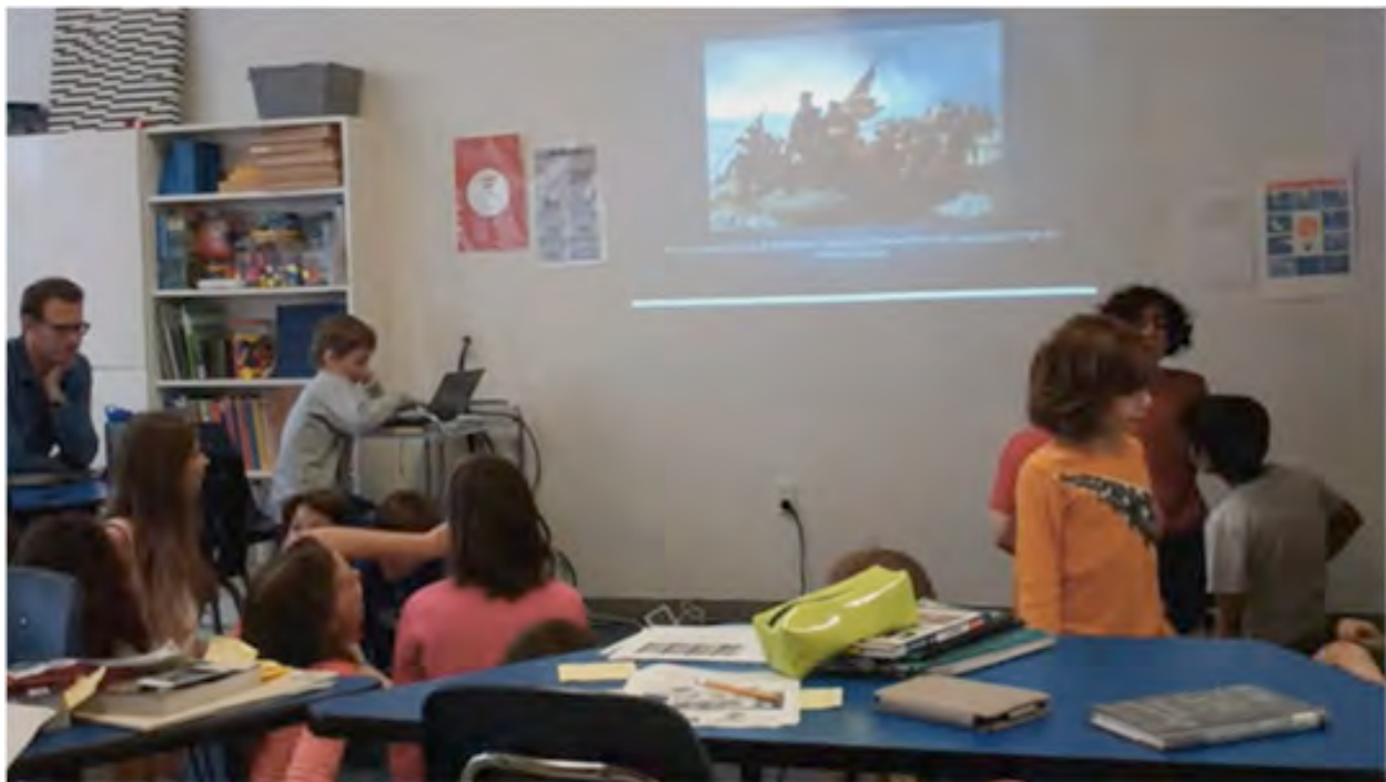
Students “turn and talk” about the image.

Before a school trip to Boston in the spring of 2013, our class transitioned from studying New York City history to learning about the American Revolution. Many students were fascinated by the series of battles fought by George Washington in the winter of 1776. During class, we examined Emanuel Leutze's George Washington Crossing the Delaware . Although this painting hangs in the Metropolitan Museum of Art, a student saw a reproduction of it in a reading I had assigned and wanted to pull up