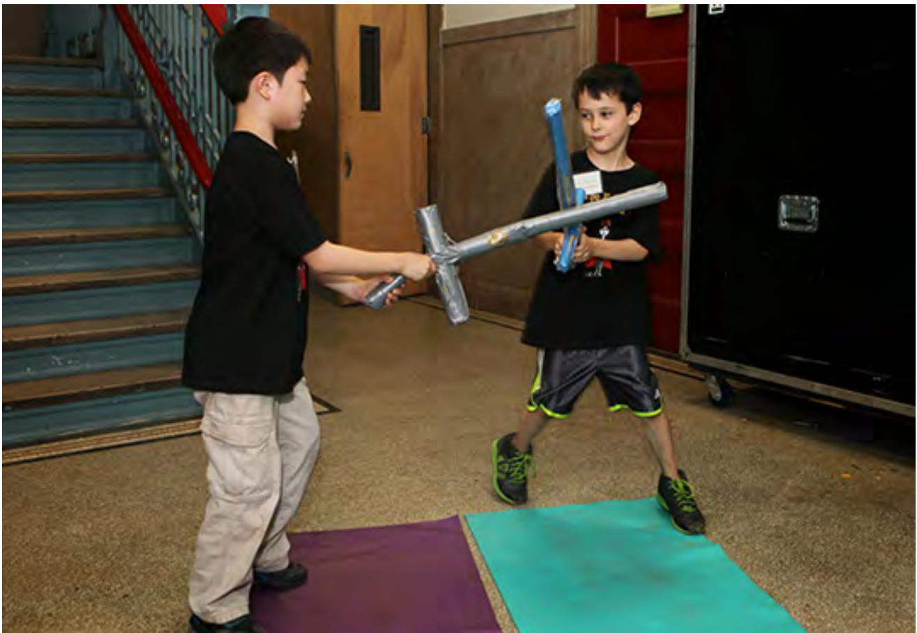
Student demonstrating fight techniques.

The theater study culminated with the first graders performing their jobs, which would allow an audience of adults and children to experience a “real” theater production for two evenings. The first performance was billed as the “preview,” followed by the official “opening night.” The evening began with a student presentation of a museum (in the rear of the theater) that displayed all of the student work generated during the study (e.g., research notebooks, script, set and costume designs). The student set and costume designers, fight directors, and choreographers took audience members through the process they used to help create the musical. In some instances, audience members even got to participate. After watching the fight directors demonstrate the choreographed sword sequence, for example, audience members had the chance to be coached by the directors and try it out themselves.