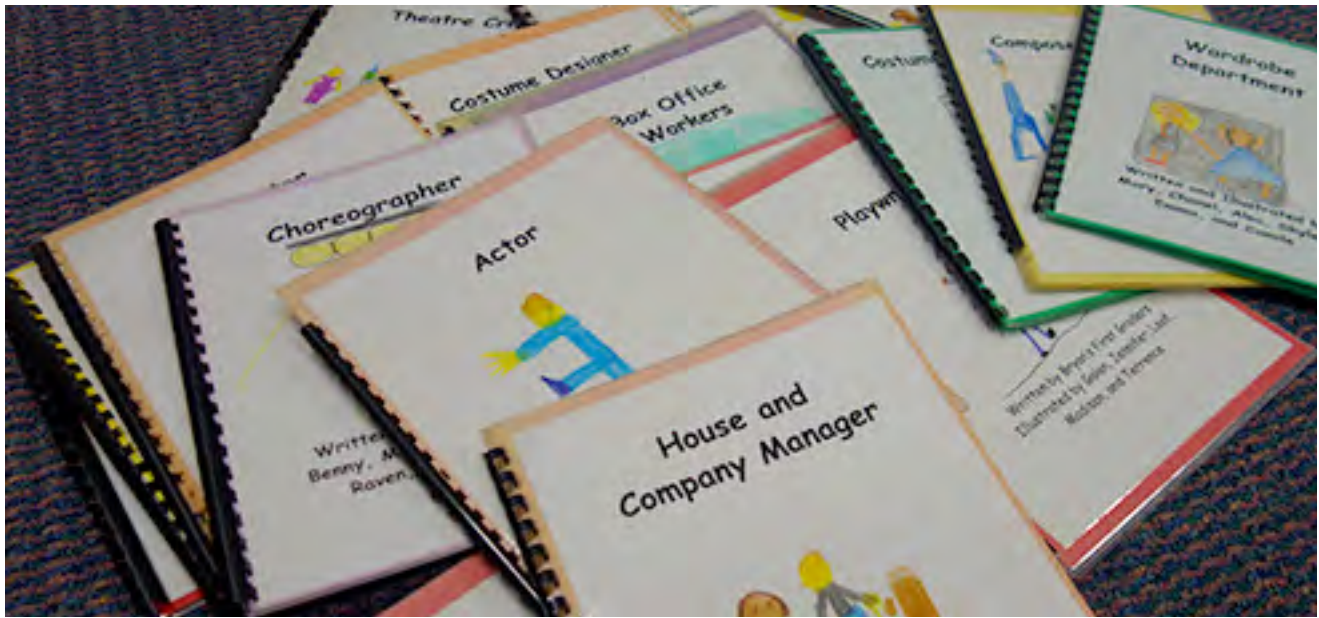
Books about theater.