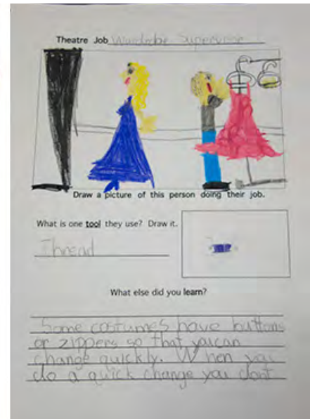
Usher, Director, and Wardrobe research notebooks.

The ongoing writing process taught students the value of documenting and reflecting on their learning experiences. Students were also encouraged to use illustrations to visualize and make sense of the theater workers' responsibilities and tools. They then transferred their job knowledge into shared books of written narratives and drawings.